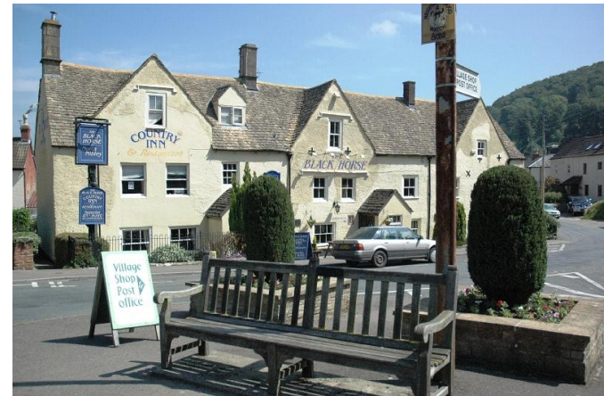
The village shop is further down on your left.

Cross the road, taking great care, and follow the sign-posted track uphill to North Nibley. At the top of the track carry straight on. Playing fields are on your right and there is a view of Nibley House. At the T junction turn left along The Street, until you come to cross roads. The Black Horse is across the road on the left hand side.